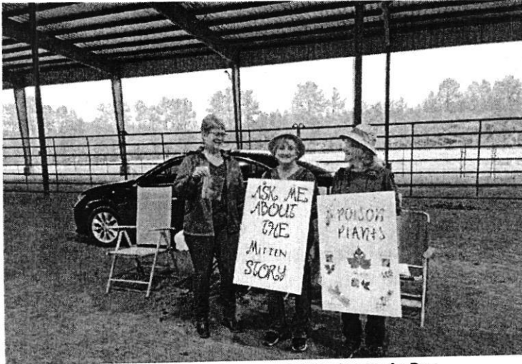
Master Gardener Lesson at Sabine County Ag Day

Educational programs of the Texas A&M AgriLife Extension Service are open to all people without regard to race, color, religion, sex, national origin, age, disability, genetic information, or veteran status.